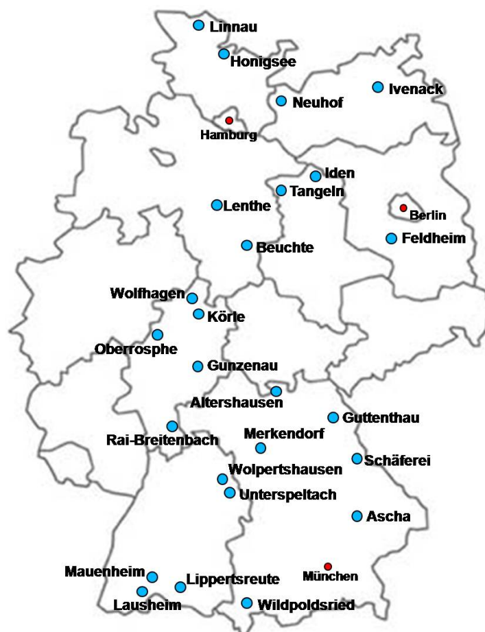
Figure 1. Location of the 25 communal renewable energy projects where initiators have been interviewed.

For the interview, one person of each village was contacted, who was substantially involved in the initiation, development and implementation of the projects. Most of the interview partners were farmers or persons engaged in the local politics, such as mayors or volunteers. The interviews took place in the 25 villages, mostly at the interview partners' homes, in town halls or in heating plants.