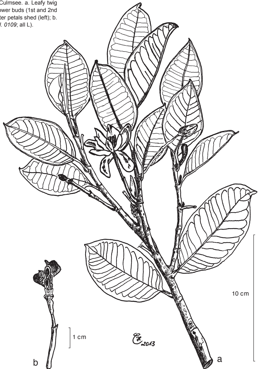
Fig. 1 Magnolia sulawesiana Brambach, Noot. & Culmsee. a. Leafy twig with flowers in four different development stages: flower buds (1st and 2nd to the right), open flower (middle) and young fruit after petals shed (left); b. ripe fruit (a. Brambach et al. 1334, b. Brambach et al. 0109; all L).

petioles, yellowish green (reddish brown when dry), glabrous, cigar-shaped, flattened and usually twisted, becoming up to 6 cm long, caducous, leaving white contrasting annular scars. Leaves glabrous except for a line of brown (pale when dry), erect, villous hairs running through the adaxial petiole groove to about the middle of the abaxial side of the leaf blade on both sides of the midrib, conspicuous in young leaves, glabrescent but often some hairs persistent; spirally arranged, usually oblong, elliptic or (narrowly) obovate (rarely narrowly ovate), the midrib arching downwards, V-shaped in cross section (midrib usually distorted when dry), (5–)6–9(–11) by (2.5–)3–4.5(–6.5) cm, ratio (1.6–)1.9–2.2(–2.4), margin entire, revolute, not thickened; base rounded to obtuse (to acute), slightly asymmetric, apex rounded to obtuse (to acute), with a short triangular, usually contorted acumen (c. 1–3 mm); coriaceous shiny green above (pale greenish brown to reddish brown when dry), paler beneath, (darker golden-brown to chestnut when dry); midrib flat and narrow above, round and strongly prominent beneath, yellowish green on both sides (concolorous with leaf blade above, chestnut and darker than leaf blade beneath when dry), running up to the very tip, there often forming a tiny, inconspicuous mucro; lateral veins (13–)15–18(–20) per side,